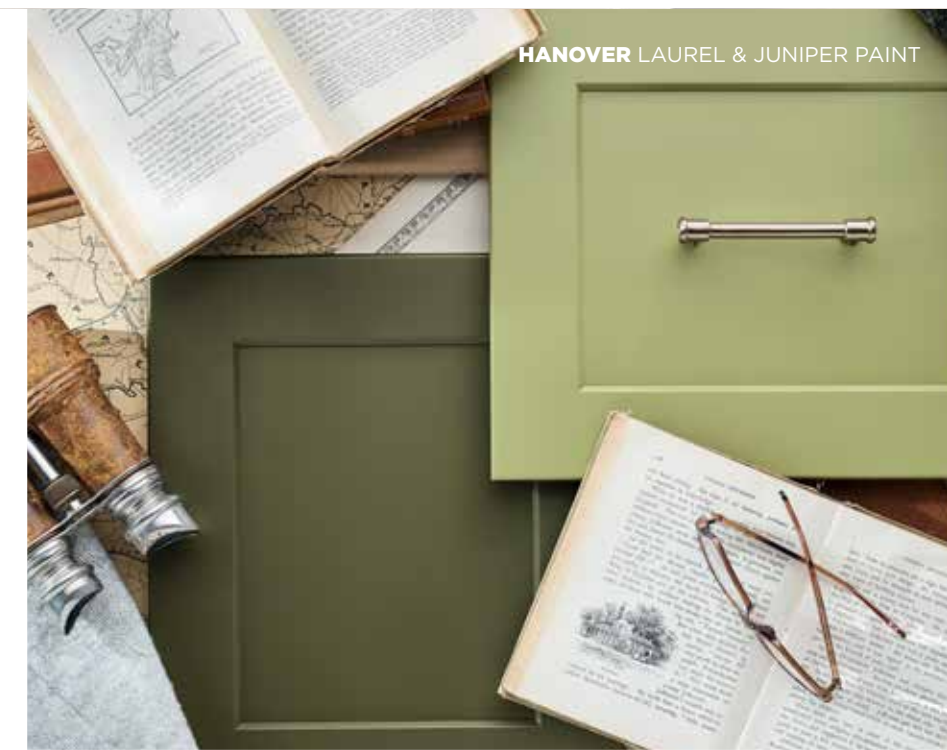
HANOVER LAUREL & JUNIPER PAINT

Personalized Solutions gives you more design flexibility with Wolf Classic cabinets so you can: