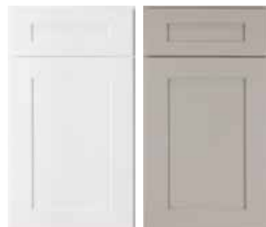
Diamond Paint Shale Paint