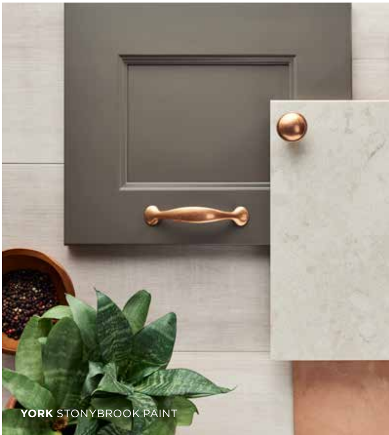
YORK STONYBROOK PAINT