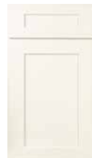
Opal Paint (coming soon)