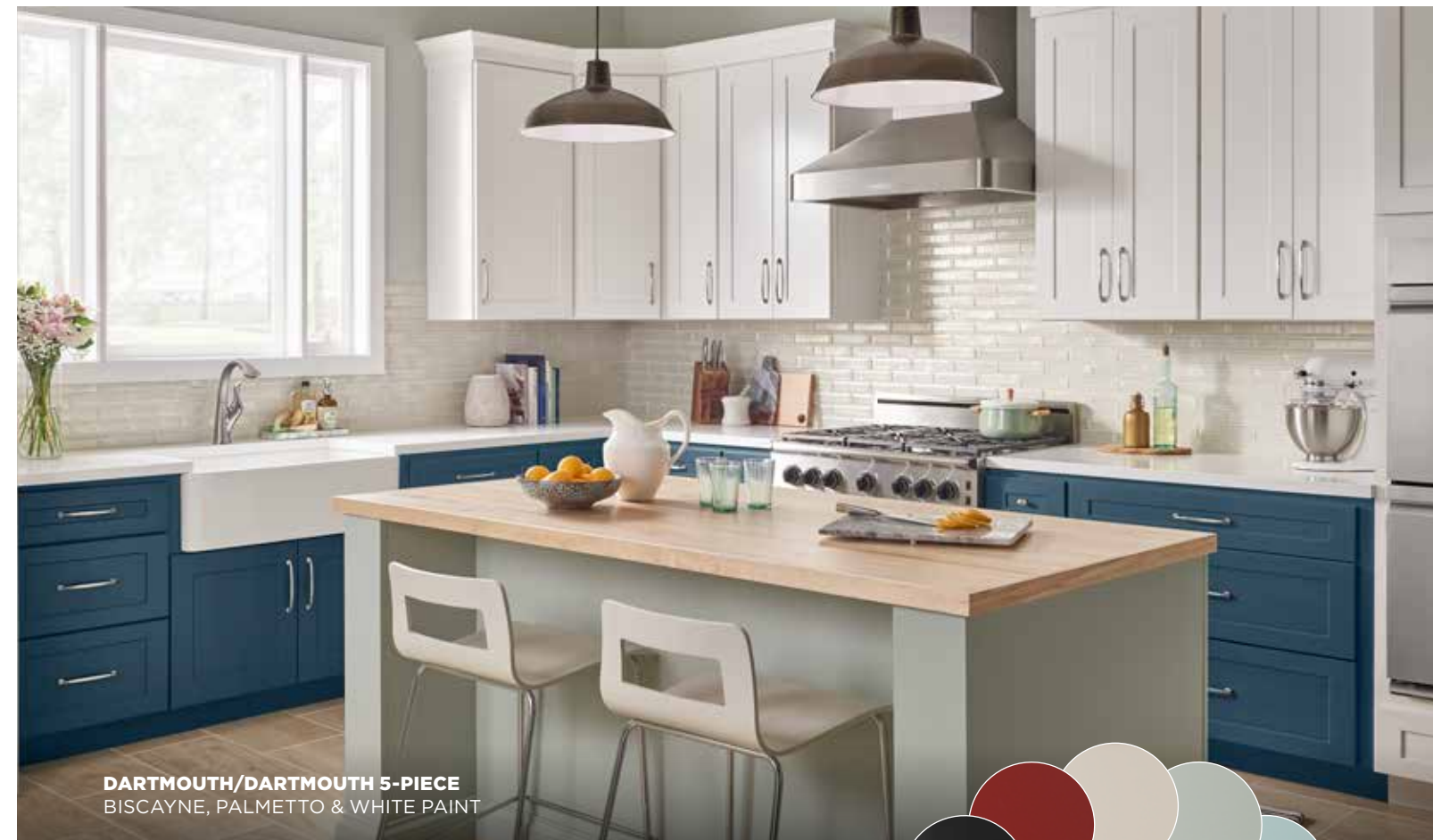
DARTMOUTH/DARTMOUTH 5-PIECE BISCAYNE, PALMETTO & WHITE PAINT