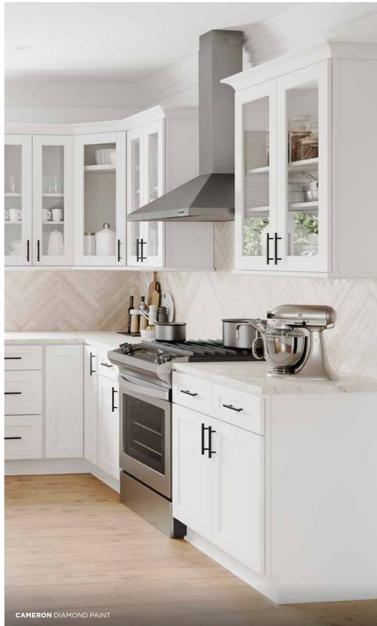
CAMERON DIAMOND PAINT