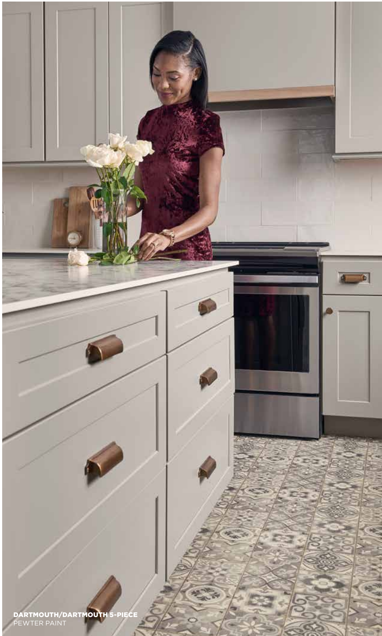
DARTMOUTH/DARTMOUTH 5-PIECE PEWTER PAINT