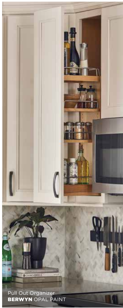
Pull Out Organizer BERWYN OPAL PAINT