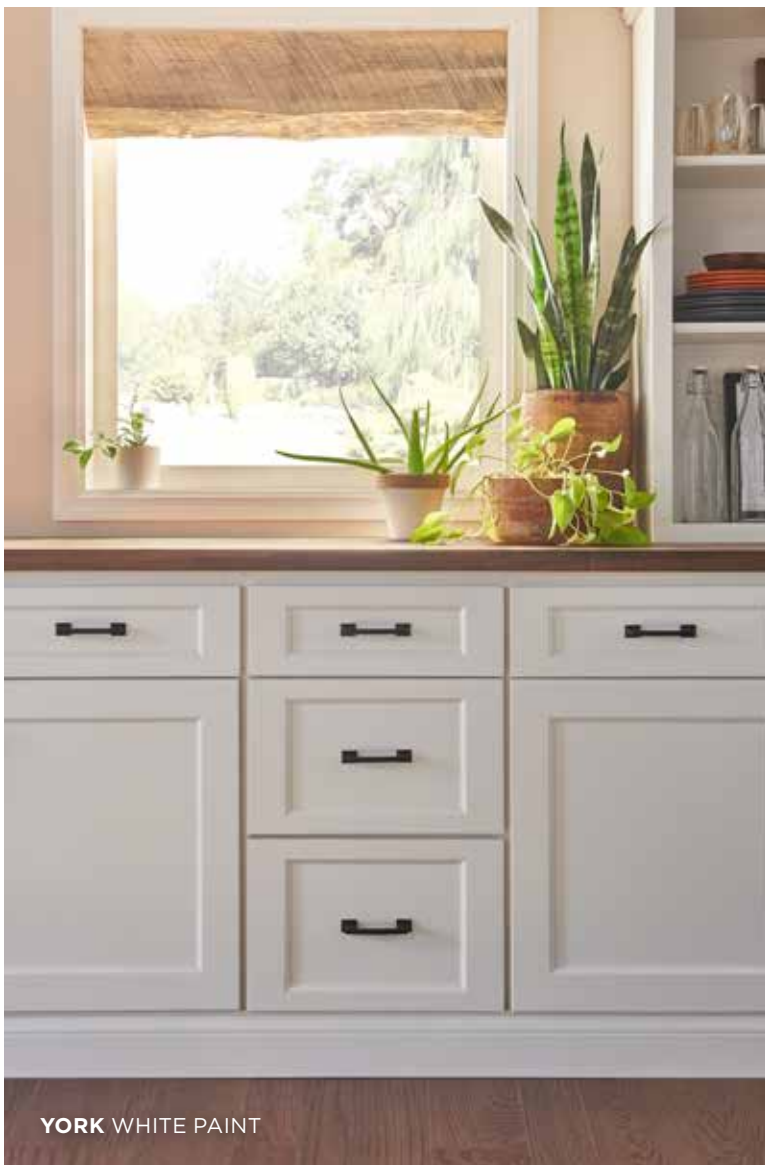
YORK WHITE PAINT