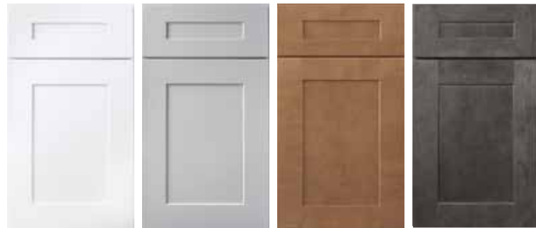
White Paint Pewter Paint Hazelnut Stain Grey Stain