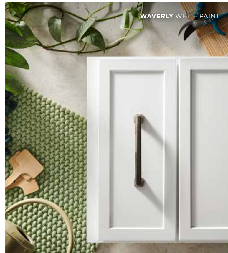
WAVERLY WHITE PAINT