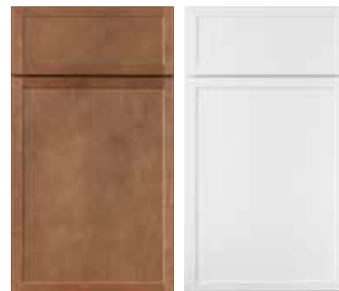
Hazelnut Stain White Paint