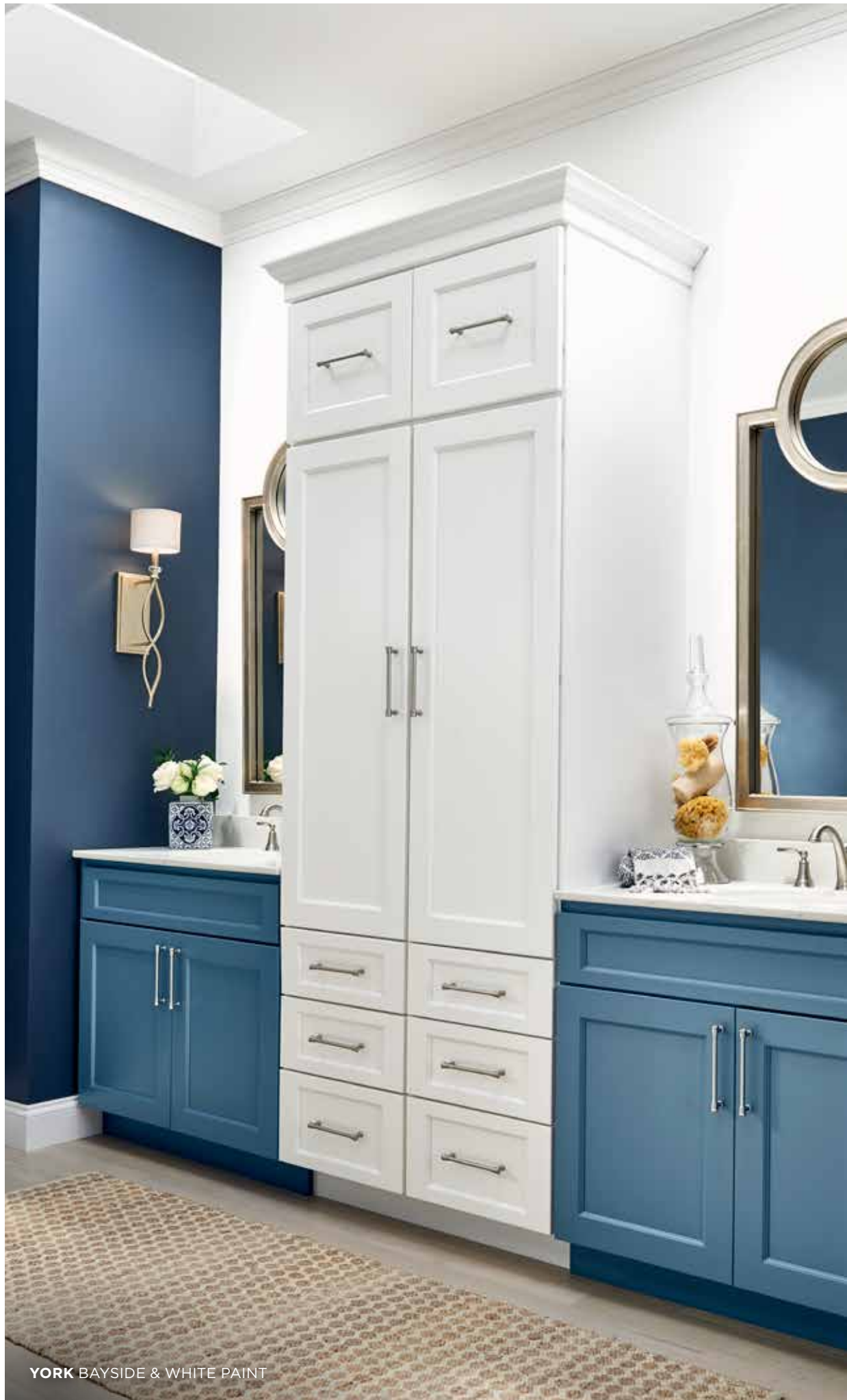
YORK BAYSIDE & WHITE PAINT