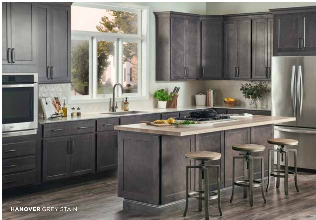
HANOVER GREY STAIN