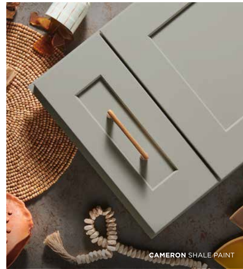
CAMERON SHALE PAINT