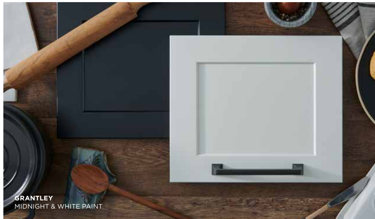
GRANTLEY MIDNIGHT & WHITE PAINT