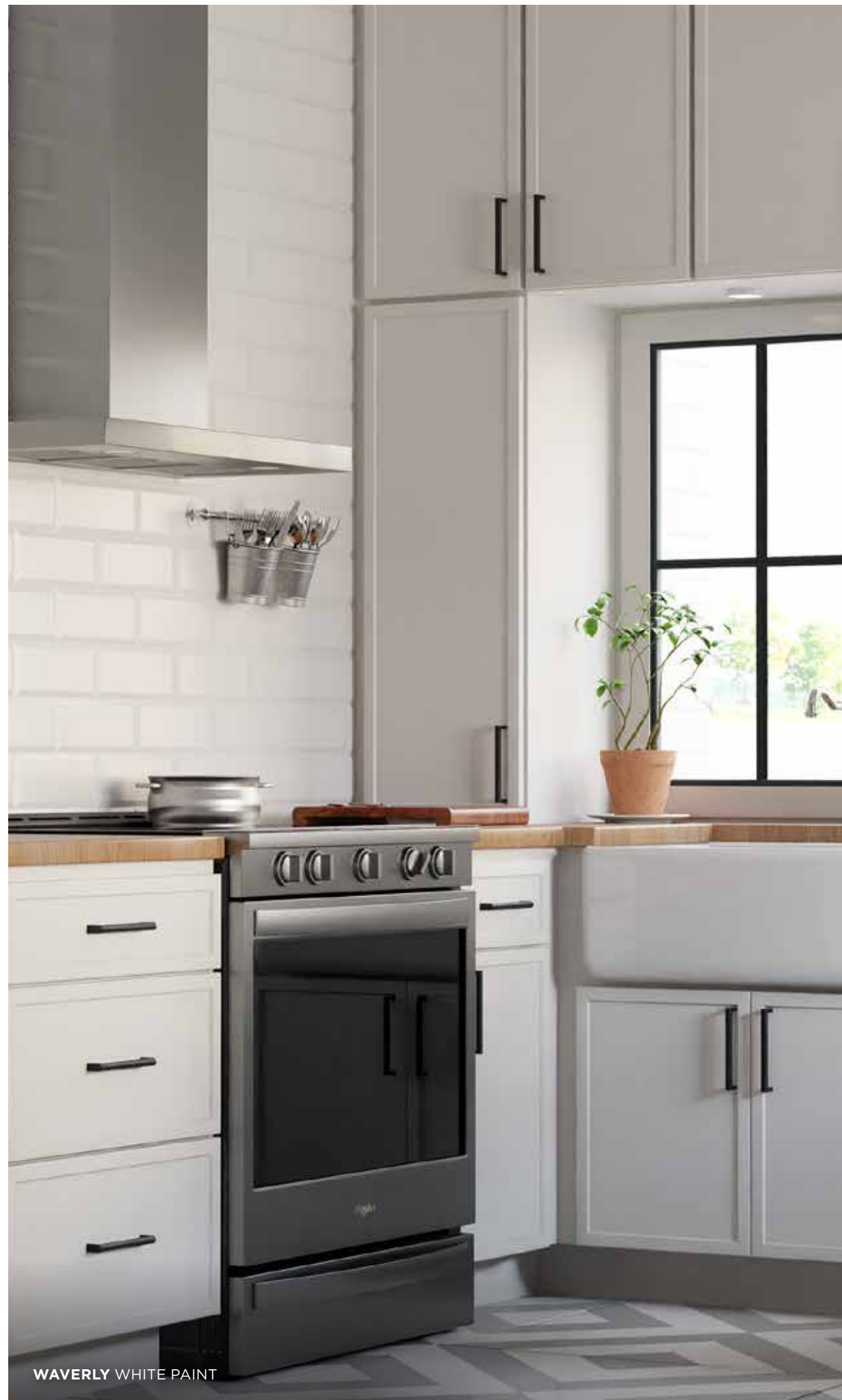
WAVERLY WHITE PAINT