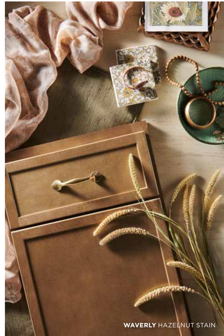
WAVERLY HAZELNUT STAIN