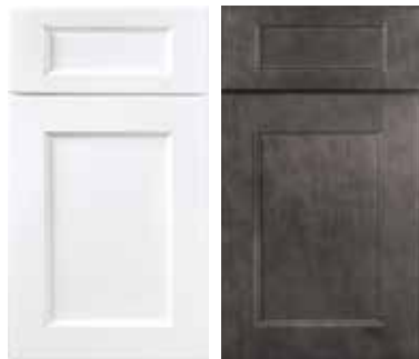
White Paint Grey Stain