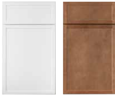
White Paint Hazelnut Stain

A slimmer profile and narrower side stiles give new Waverly cabinets just enough of the shaker tradition, but with a touch of elegance and simplicity that elevates the timeless style. Available in White Paint or Hazelnut Stain.