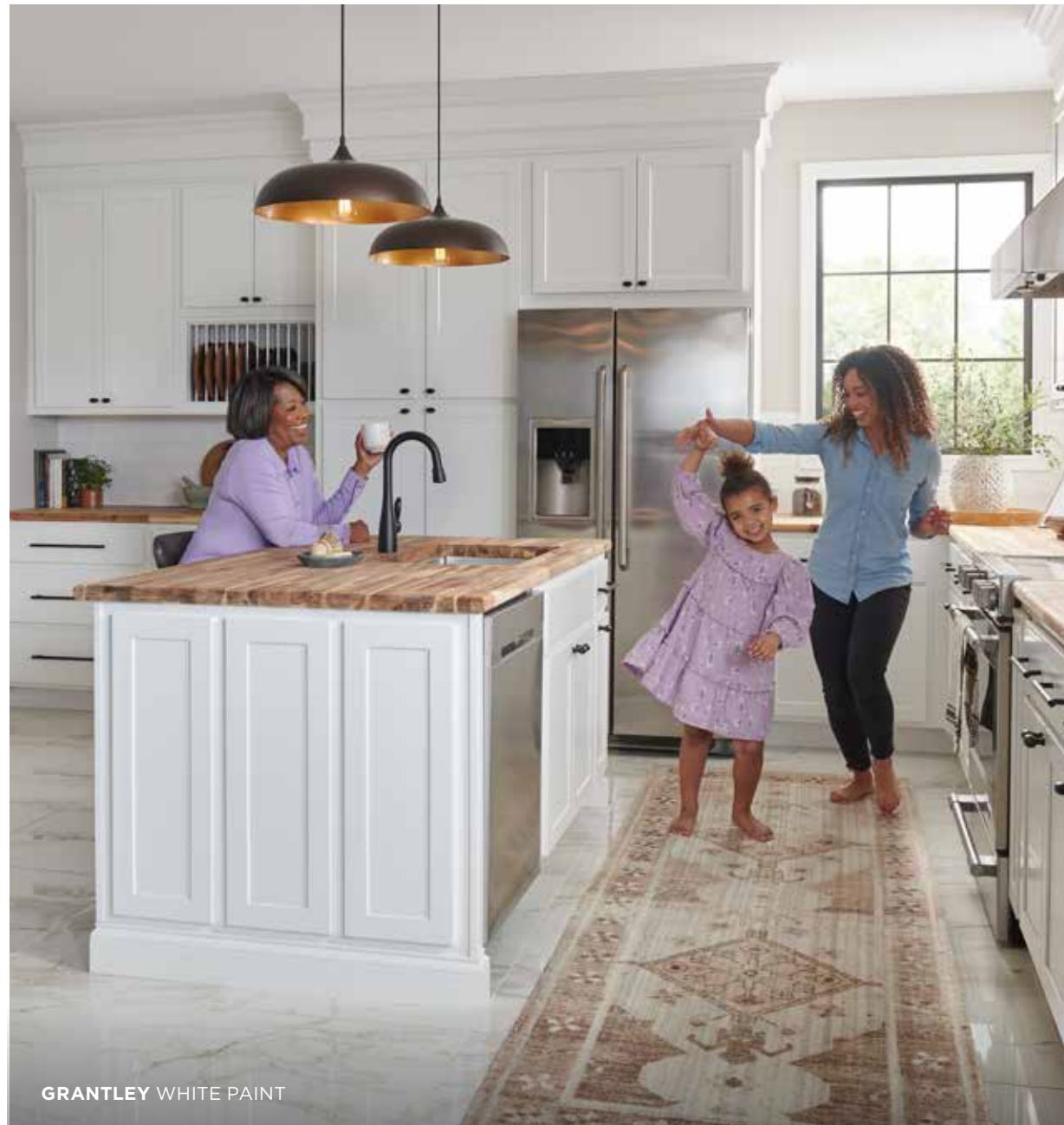
GRANTLEY WHITE PAINT