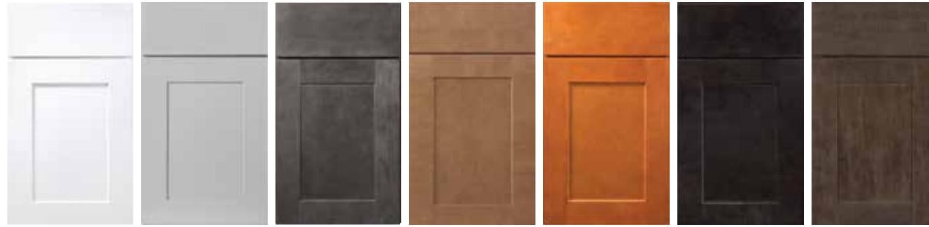
White Paint Pewter Paint Grey Stain Hazelnut Stain Honey Stain Dark Sable Stain Brownstone Stain