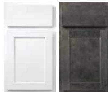
White Paint Grey Stain