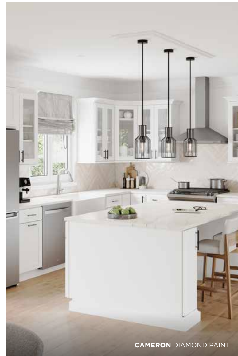
CAMERON DIAMOND PAINT