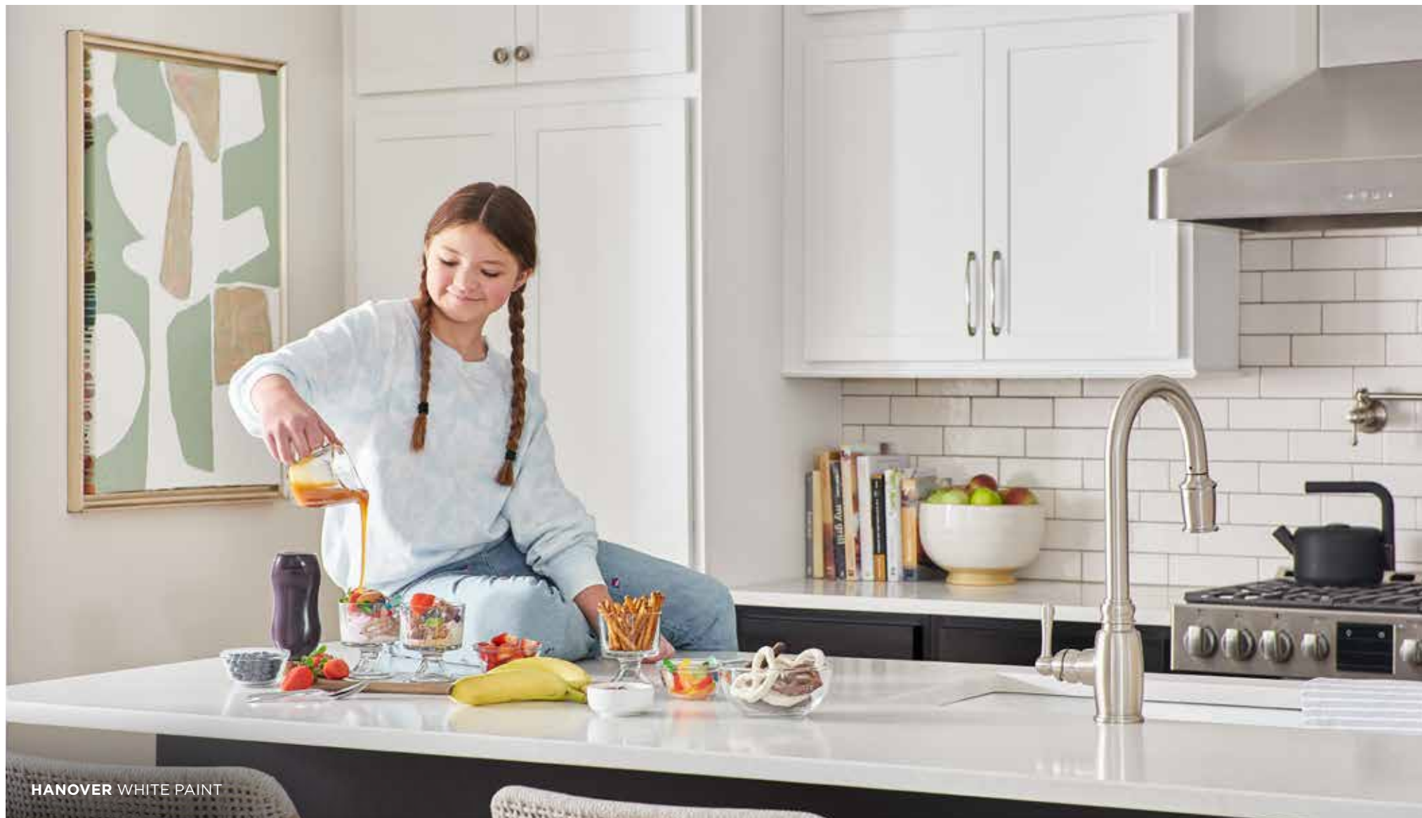
HANOVER WHITE PAINT