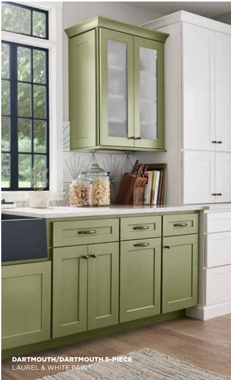
DARTMOUTH/DARTMOUTH 5-PIECE LAUREL & WHITE PAINT