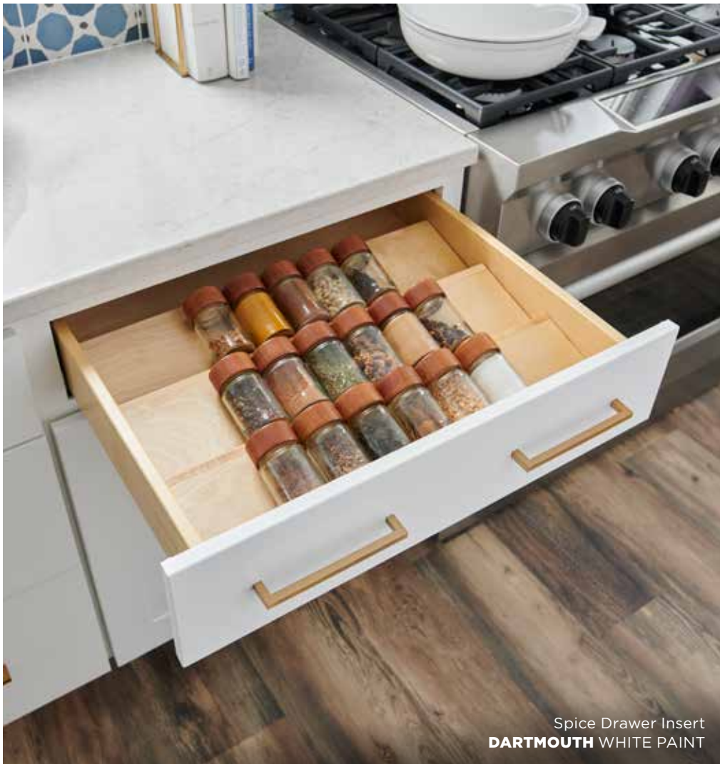
Spice Drawer Insert DARTMOUTH WHITE PAINT