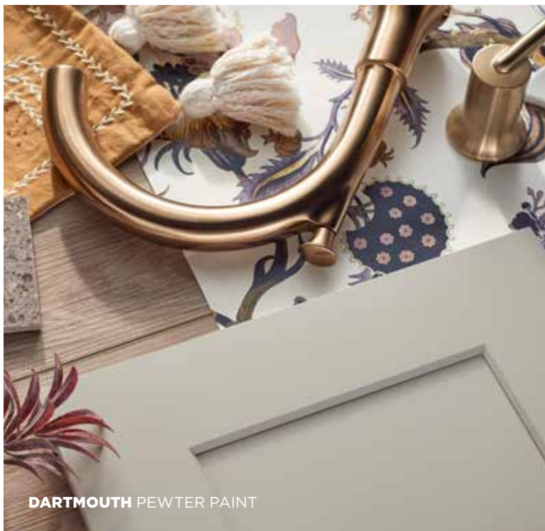
DARTMOUTH PEWTER PAINT